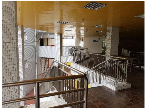
4. Take the stair down