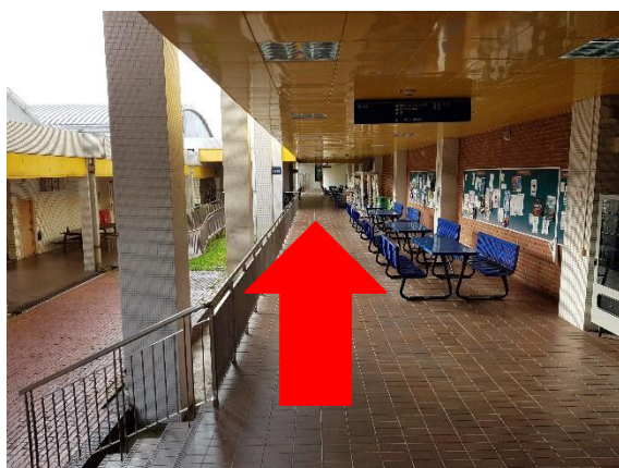
5. Continue walking straight