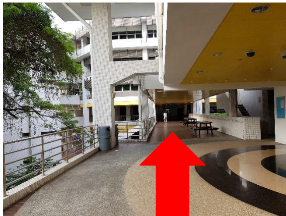
3. Turn left after exiting the lift